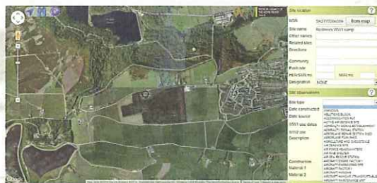
Locate and record your site step-by-step with our online form or mobile app

Across the 2014-18 centenary, we are looking for the remains of practice trenches and locating training camps, seeing how many drill halls and munitions factories survive, identifying military hospitals and finding the very first pill boxes.